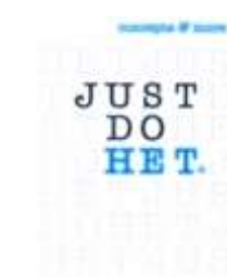
Benelux appl. no 1162579

In a recent Benelux case Nike successfully invoked her trademark rights on the slogan JUST DO IT against the trademark JUST DO HET. The marks were considered too similar. Furthermore, since JUST DO HET was applied for athletic and cultural events, which was seen as similar to Nike's activities the trademark application was cancelled.