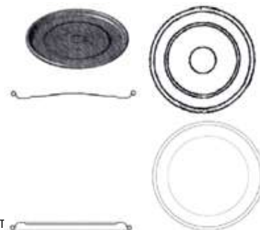
top: new 74463 Bottom: old 53186

Pepsico registered a disc shaped toy in 2003. On the basis of an older registration a cancellation procedure is started against Pepsi. The older design was registered for "metal discs for games".