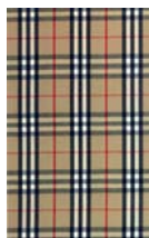
EU reg. 377580

This fact, however, does not stop everyone from introducing similar marks on the market. Recently SACHA, a fashion designer that specializes in shoes, introduced a new shoe which had a pattern similar to Burberry's. SACHA claimed that Burberry's pattern could not be a trademark because it was nothing more than a Scottish pattern. The judge, however, did not share this vision. Not only did Burberry's pattern have distinctive abilities when it was first registered in 1996, it also deserved a large scope of protection due to its reputation.