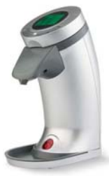
Aldi Soap Pump

Retailer Aldi recently sold a soap dispenser which had all the characteristic traits of the SENSEO design. Philips immediately started a procedure on the basis of the design registrations and copyrights. The court decided in Philips favor and prohibited Aldi from further selling the soap dispenser. Coercive measures could amount to up to € 250.000,-.