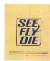
2004 Terrorism gala

In 2004 Schiphol was also unpleasantly surprised. In promoting the artist manifestation The Great Gala of Terrorism yellow bags were printed with the print: SEE FLY DIE. The threat of a law suit was enough to have these bags replaced with the real SEE BUY FLY bags. Against Optitrade Schiphol demanded a direct prohibition on the basis of her trademark registrations. The court decided in Schiphol's favor. The slogans were too much alike, and in the advertisement unjust reference was being made to Schiphol's slogan. A prohibition with coercive measures followed.