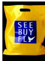
BX reg 0620952