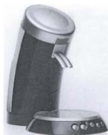
Int Design Senseo

In designing the SENSEO Philips realized a unique concept for the shape of a coffee machine. In order to protect this shape, Philips has registered various designs.